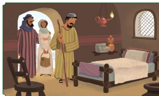
A Shunammite Couple Showed Hospitality to Elisha

If we died with Christ Jesus, we believe we will live together with him. We know that, since Christ Jesus rose from the dead, he cannot die again. Death no longer has power over him.