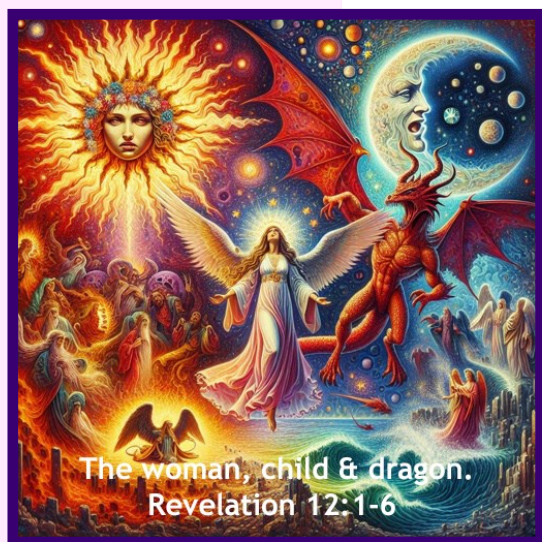
The woman, child & dragon. Revelation 12:1-6