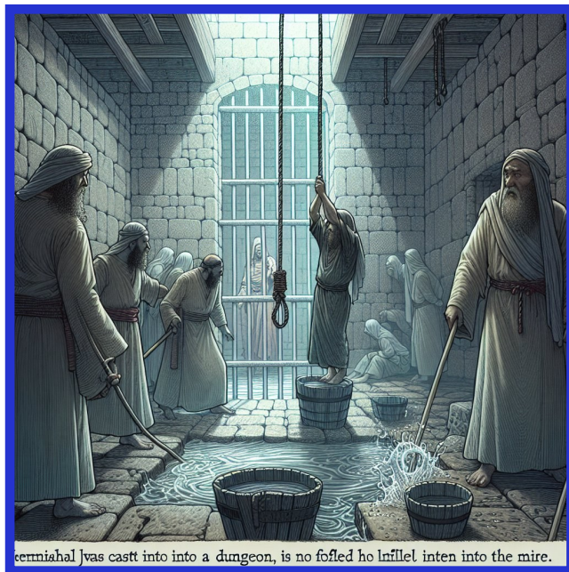
Jeremiah was cast into a dungeon, is no felled ho luffel inten into the mire.