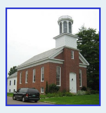
Welcome to our new church home!

People Respond: "Forgiving God of Healing, hear our prayer."